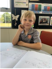
Principals Award Awesome writing Anvil